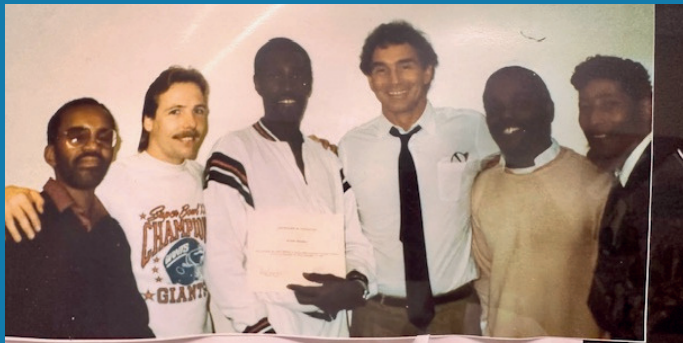
Cycle 1 Graduation