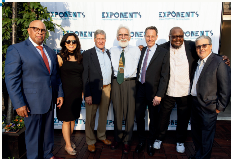
Board Members at the Annual Gala