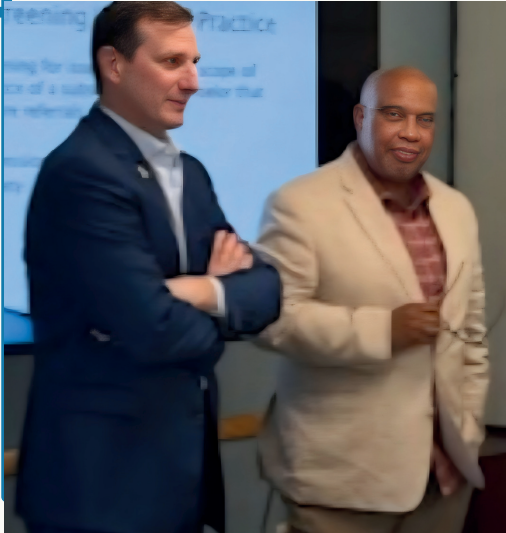
Congressman Dan Goldman & Joe Turner

Exponents like many other providers is operating in an extremely challenging environment for treatment services. As we move forward, the continued development of sustainable sources of revenue from The Center, Harm Reduction turnkey training and "Train the Trainer" will be critical to our continued success. The board will also continue to work closely with the leadership team to connect with individuals and foundations to reduce our dependency on increasingly volatile public funding. The need for Exponents services is greater than ever and the organization is well positioned to meet the challenge.